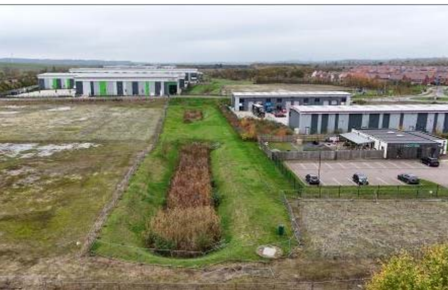
Bedford Commercial Park