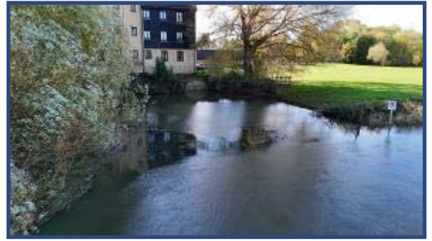
Above: Kempston Mill Pond proposed winding point. Below: Start of Waterway just before Kempston Mill Weir

Using drone aerial images to document the route helps us understand the terrain the waterway will cross and any hidden difficulties that are hard to see from the ground. It also lets us document the waterway route before and after construction. ●