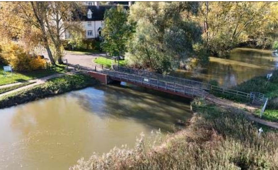
Kempston Mill Bridge and landing stage (under water due to river in flood )