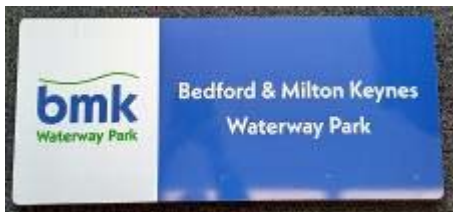
One of the new signs

These signs will only be erected on roads controlled by BBC (your editor adds). While it would be ideal to have signs on the A421 near our existing underpass, this road is in the jurisdiction of National Highways. Erecting signs on their roads is much more complicated and expensive and so wasn't part of this exercise. This remains on the "to do" list, as we begin to talk to the councils in Milton Keynes and Central Bedfordshire about signs in their areas. ●