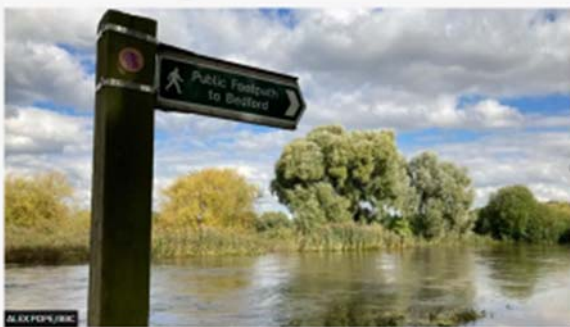
The waterpark would provide leisure activities and a chance for nature "to recover" the Bedford and Milton Keynes Waterway Trust previously said