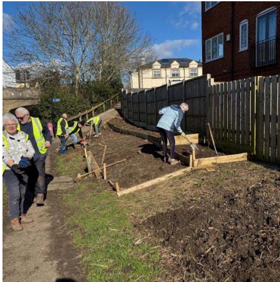
“Before” and “During” pictures of the Fenny work