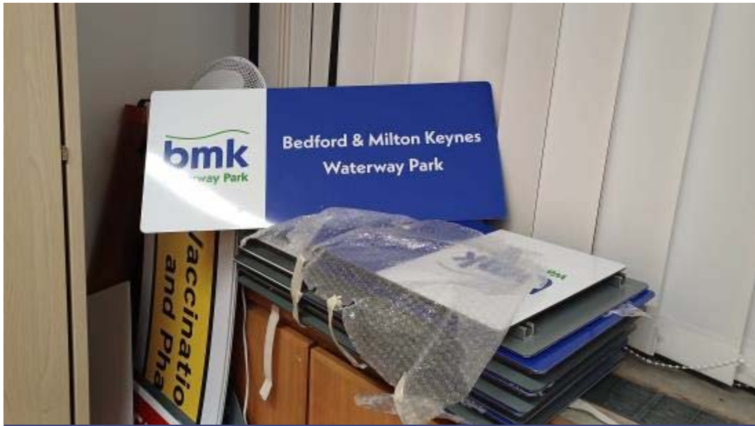
The newly arrived signs awaiting installation