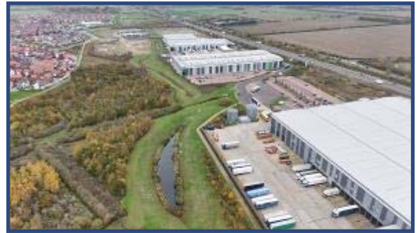
Above: Bedford Commercial Park Below: A421 Culvert