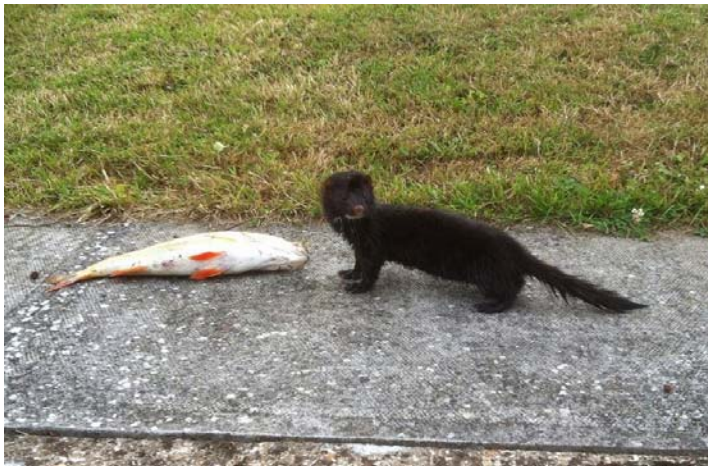
A mink at Bedford Town Lock

Over the years, invasive American mink have been seen in several areas of the Great Ouse around Kempston and Bedford (Alan Mayo writes). In the UK, mink in the wild have escaped from captivity, and are predatory mammals that feed on small animals such as water voles and small nesting birds. They are the cause of a significant reduction in the numbers of these native species, and hence the need for their eradication.