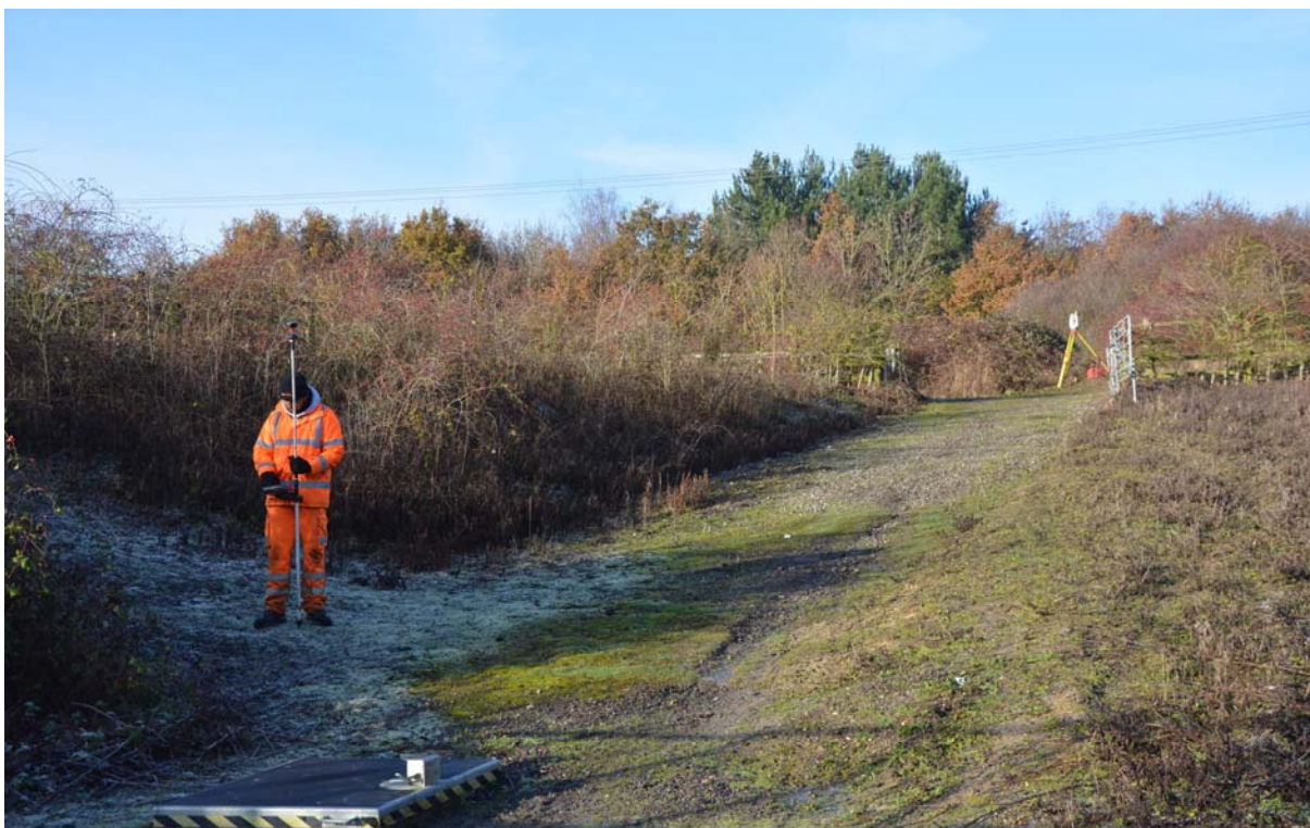
Carrying out the survey

therefore recently commissioned and had carried out, a topographic survey from the A421 underpass to Fields Road that checks and correlates with the Goodman information. The full survey results are due shortly, which will allow the EPG to next consider the options for Waterway development between the A421 underpass to Fields Road. ●