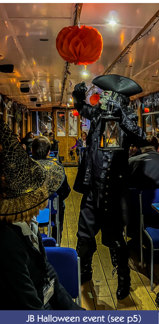
JB Halloween event (see p5)

These situations are generating a wider political will to make change happen which in turn is creating more interest in the strategic role of the Waterway and the link it provides between the wet west and dry east of the country. Water Resources East and the Environment Agency are partners of the Trust and are looking for solutions to their problems. So, unlike my first days as a Bedford resident, when times seemed ominous, this feels like a propitious moment for the future of the Waterway. ●