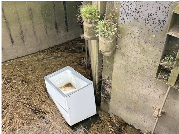
Entrance to the Old Bedford River

It will only take you a few minutes via our website www.waterways.org.uk , but could put the waterways on the right path for years ahead. ●