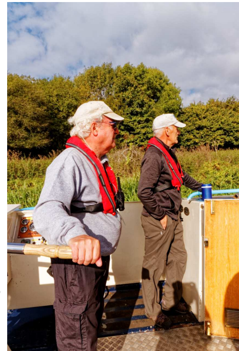
This could be you!