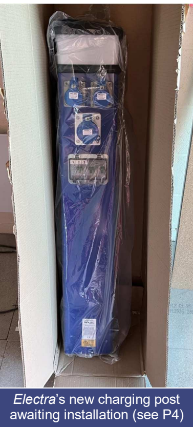
Electra 's new charging post awaiting installation (see P4)