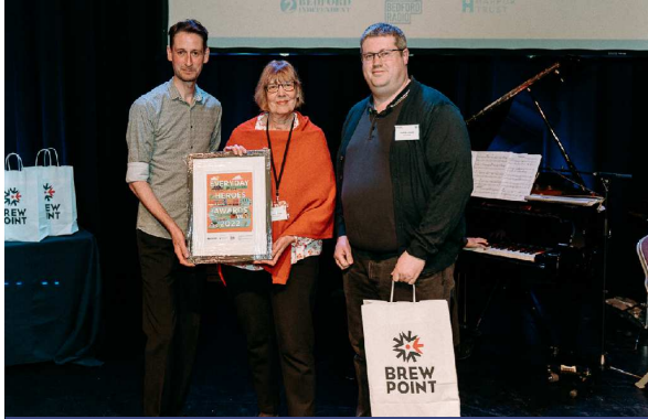
Receiving the award