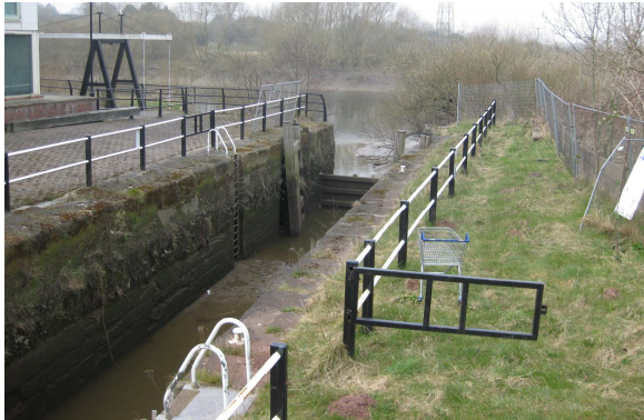
Dee Lock, the entrance to the Dee Branch of the Shropshire Union from the River Dee in Chester

IWA was formed to protect our inland waterways in 1946 at a time when they were under threat. As a result of IWA's work many navigations that would have closed remained open. Appreciation of the value of our waterways began to grow and restoration schemes got under way. We can now say proudly that since IWA was formed 500 miles of waterways have been restored and another 500 miles are under restoration.