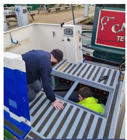
Removing the existing batteries for testing onshore

The team was pleased to see Electra described as the Trust's first electric boat on the Trust's new signboard at the start of the B&MK at Campbell Wharf. It is a ground-breaking project, with all the ups and downs that this entails. ●