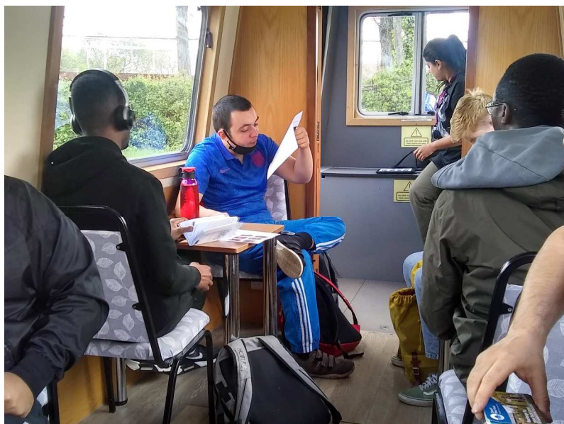
Students from MacIntyre on a pilot cruise

For the Jubilee, John Bunyan received its QAVS. Electra had to settle for a cardboard cut-out of the Queen