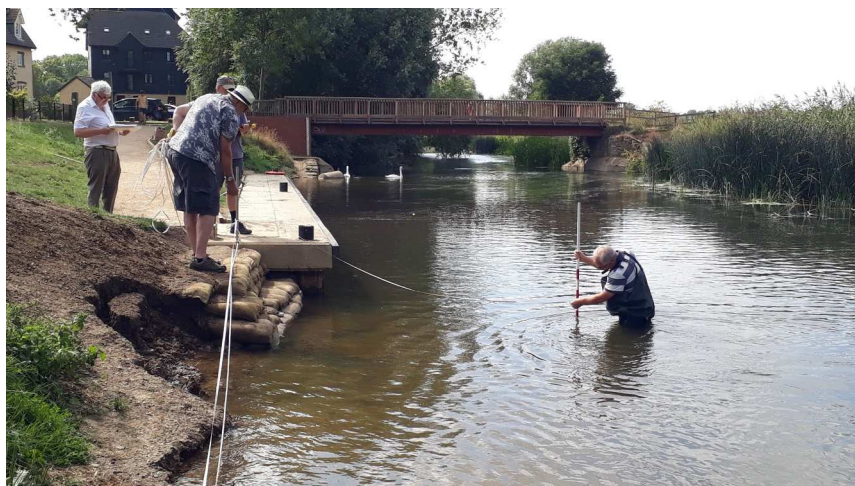
Surveying the river

Fields Road Development. The ponds along the route of the waterway which have been built to take any rainwater from the hardstanding areas in this warehouse industrial development are now completed. We are hoping to obtain as built drawings from the developer so that we can look into the feasibility of joining these up to form a useable stretch of waterway. Whilst these have been promised to us, they have not yet been received. ●