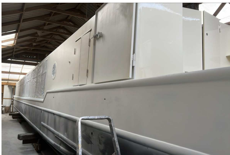
JB being repainted

trips, we offered charter trips with up to 50 passengers, and many of these were at full capacity. This season we have carried over 5,800 passengers on the public cruises and charters on a total of 155 cruises with 54 active volunteers at the beginning of the season and increasing to 72 volunteers at the end of the season. Huge thanks to all the volunteers who have given their time and effort to ensuring that the John Bunyan had a successful season.