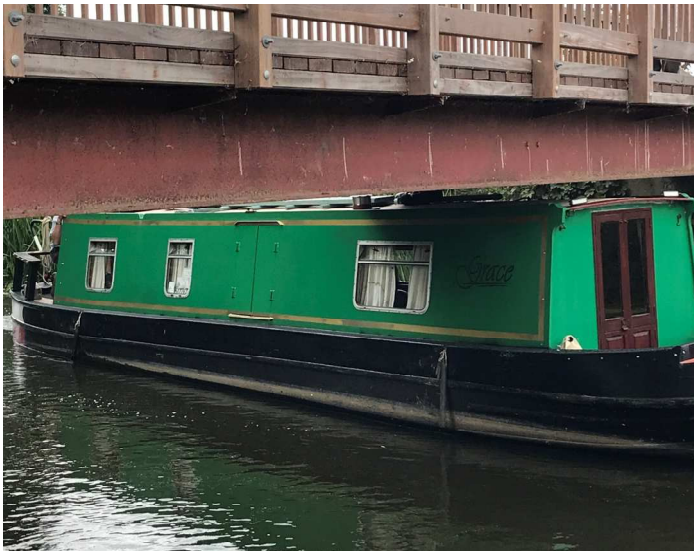
Grace just fits under the bridge

By a happy chance, on the day the surveying was taking place at the landing stage, NB Grace was attempting to reach the head of navigation, Kempston Weir. This is the point defined by the Inland Waterways Association as a Silver Propeller destination for their award to encourage use of less used waterways.