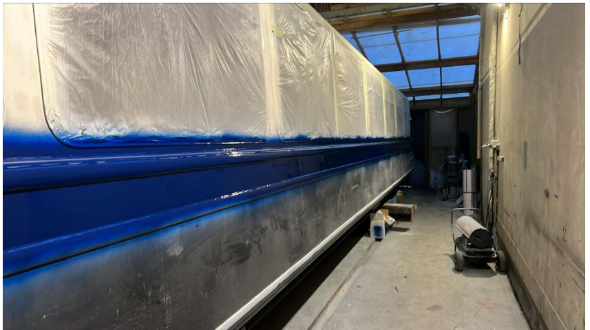
JB being repainted

The John Bunyan is currently undergoing its 5 yearly repaint. We hope to have JB back at Priory Marina in time for us to run some Christmas cruises. Progress is going very well. We have also worked with the MCA to have the out-of-water inspection completed, and just need the in-water inspection to be completed to be awarded another 5 year passenger certificate.