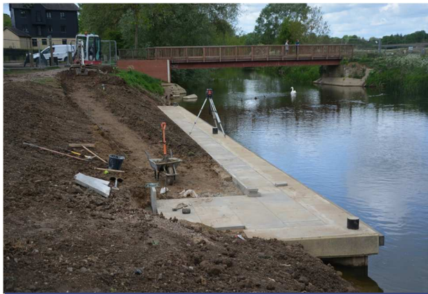
Phase 2 in progress