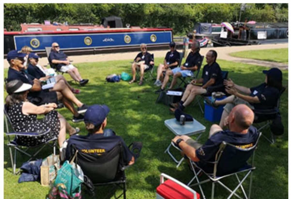
A community enjoying the waterside

The boats are raising awareness and funding - every boat guest is offered