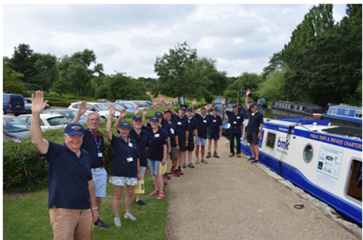
Electra volunteers by the boat

Buy two, get one free! Book a place for three consecutive editions, and only pay for the first two. For details contact: editor@b-mkwaterway.co.uk