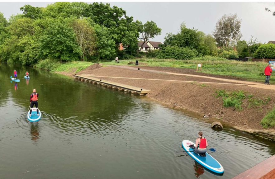
Complete, and popular with paddleboarders