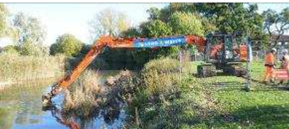
(above) Long reach excavator on the first day of work and (below) with weeds cleared