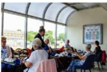
Afternoon Tea at the Mercure Central, Bedford

Our first cruise of the season started with the late May spring Bank Holiday mini cruises of 45 minutes along the Bedford waterfront and embankment. Our normal Wednesday afternoon Tea cruises to Barns Hotel had to be rescheduled this season to the Mercure Central Bedford Hotel as the Barns Hotel was badly flooded over last year's Christmas / New Year period. The Mercure provided Afternoon Tea customers with spectacular views of the river from the first-floor bar area where the Afternoon Tea is served. The views are some of the best in Bedford providing views of Town Bridge, The Swan Hotel and Castle Mound.