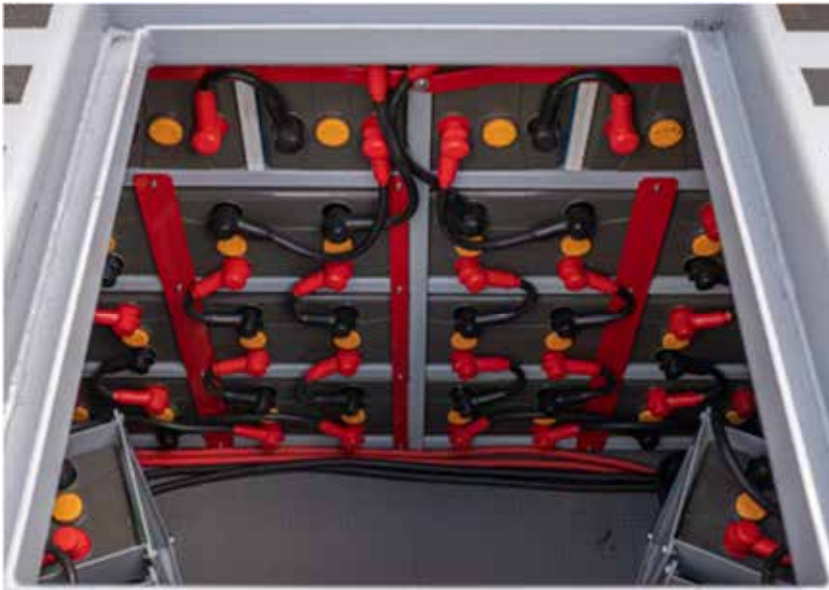
Part of Electra 's large array of batteries sit under the stern deck

Our propulsion system is based on 48 lead-carbon batteries (these don’t use rare earths like lithium), and we are very hopeful that within the eight or ten year life