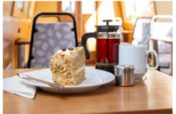
Winter morning coffee and cake

We’d love to be able to claim more of our produce is from local suppliers, but so far we haven’t found a local supplier of really good clotted cream!