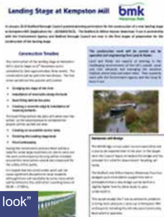
Below: "How the finished river edge should look"

We have delivered a leaflet to the residents closest to the construction site. This includes a description of the works to be carried out, who will do the work, and that some large machinery will be needed. We also provide an update on the Kempston Mill Bridge. Larger copies are on the Kempston notice board and attached to the site fencing during construction.