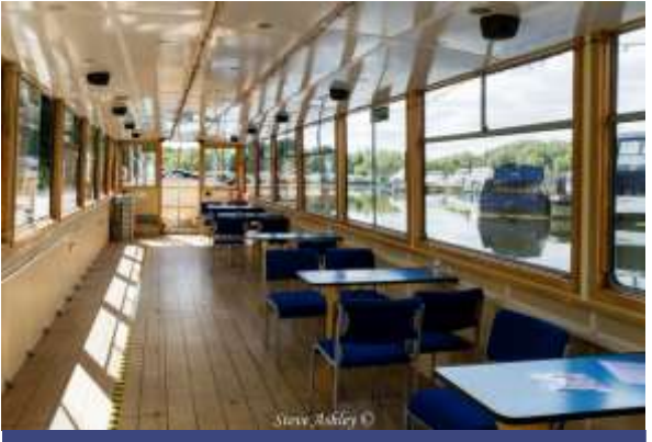
John Bunyan - Covid-Secure

The volunteers have worked hard during the pre-season period getting the JB ready for the season and with COVID-19 training to ensure the safety of the passengers.