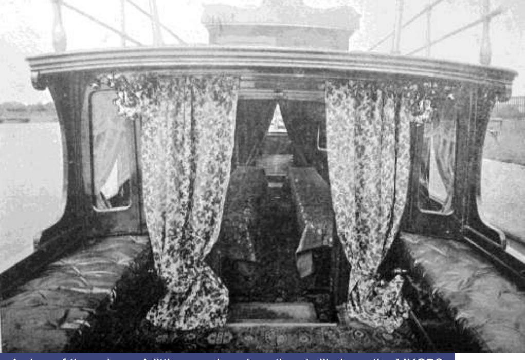
A view of the saloon. A little more luxurious than is likely on the MKCB?

These pictures are from the East Anglian Waterways Association website, where there are many more pictures and much more information about this unusual boat, and the Enchantress , which tried to cash in on the good name of the Viscountess .