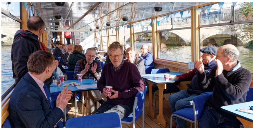
On the John Bunyan