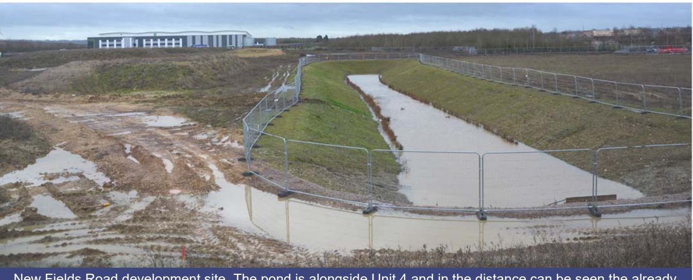
New Fields Road development site. The pond is alongside Unit 4 and in the distance can be seen the already built and occupied Unit 6 – used by Amazon

A 3m wide path will be built from here, alongside the waterway route, on the right of the ponds which may become part of a long-distance cycleway and footpath.